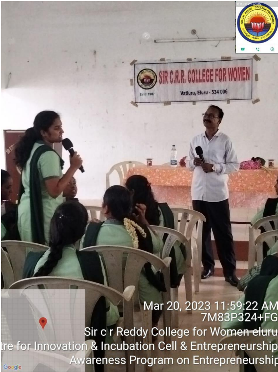
Students asking doubts about the topic