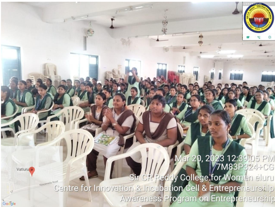
Students attended in the Awareness Program