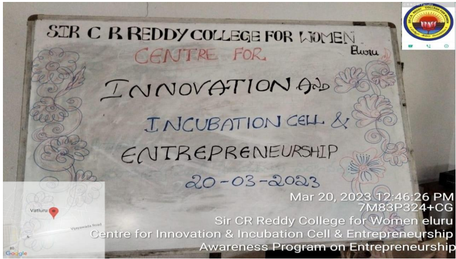
Awareness program on Innovation, Incubation & Entrepreneurship