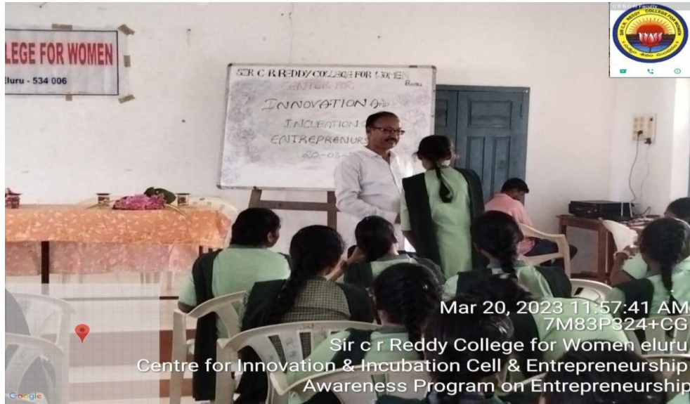
Speaker interacting with students