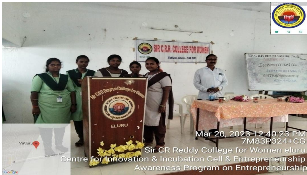
Prayer song by students